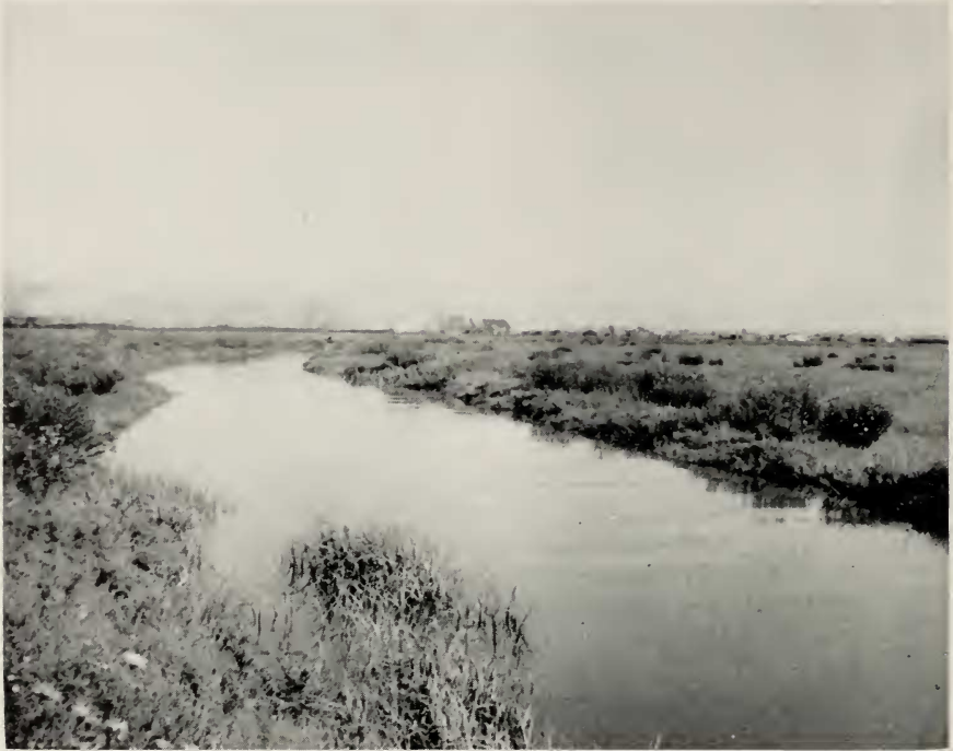
FIG. 1. A tidal slough on San Pablo salt marsh. The slough is about 25 feet wide. In the center foreground Spartina is evident; along the slough banks grows Grindelia ; the remainder of the vegetation is almost wholly Salicornia .

Numbers of the owls. —A trustworthy method of counting these birds was not developed. The behavior of the owls in the presence of an observer was highly unpredictable. They would not necessarily flush when an observer was as close as 20 yards from them. Those that did flew variously 50 to 500 yards. It was not always possible to determine the exact spot on the marsh where the birds alighted because the marsh is flat and diagnostic landmarks uncommon. Thus, when an owl was flushed, frequently it was difficult to know whether or not it had already been counted.